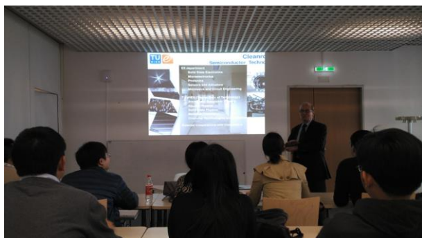
Figure 3 Workshop