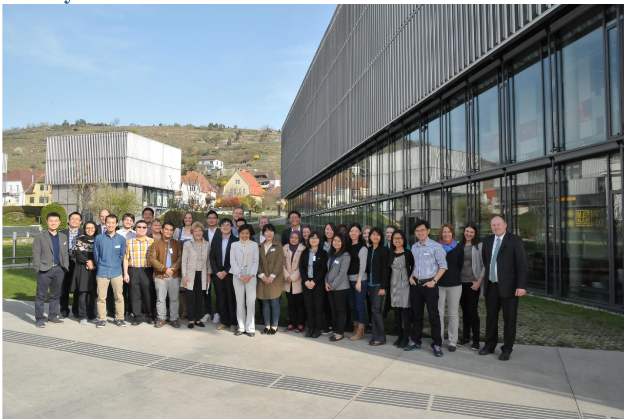
Figure 1 Group photo of ANC2016