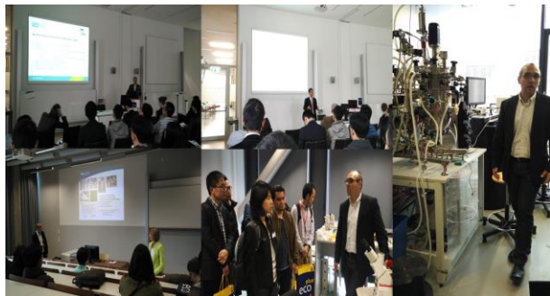
Figure 2 Site-visit